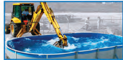
A vigorous backhoe test is performed prior to the launch of each new pool